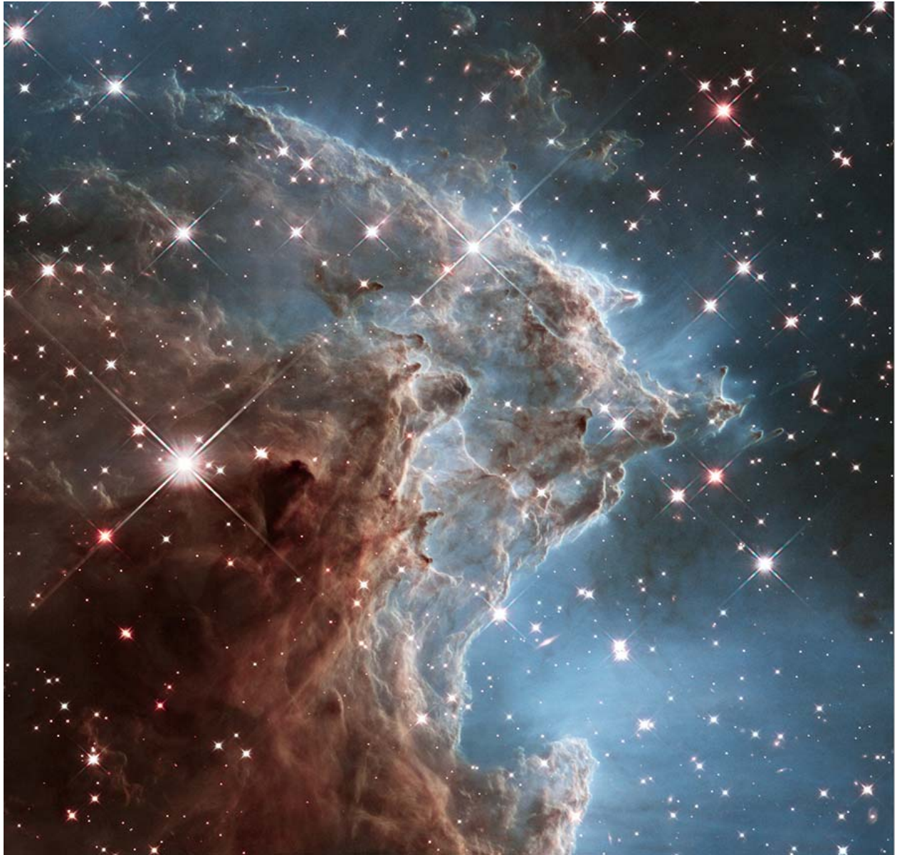
Star-Forming Region NGC2174

Exploring the Outer Boundaries of Psychopathology